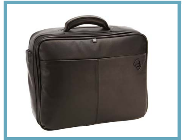
TAL3111HY Clam case