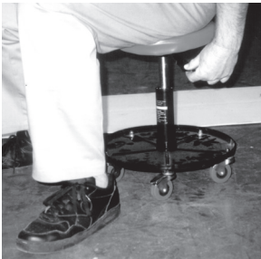
Diagram I, Lowering Seat

NOTE: Some parts are listed and shown for illustration purposes only and are not available individually as replacement parts.