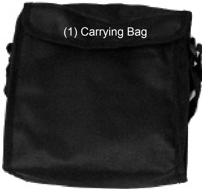
(1) Carrying Bag

NOTE: These parts are listed and shown for illustration purposes only and are not available individually as replacement parts.