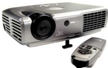
Dell 3200MP Projector