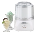
Ice Cream Makers

Cuisinart offers an extensive assortment of top quality products to make life in the kitchen easier than ever. Try some of our other countertop appliances and cookware, and Savor the Good Life®.