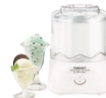
Ice Cream Makers

Cuisinart offers an extensive assortment of top quality products to make life in the kitchen easier than ever. Try some of our other countertop appliances and cookware, and Savor the Good Life®.