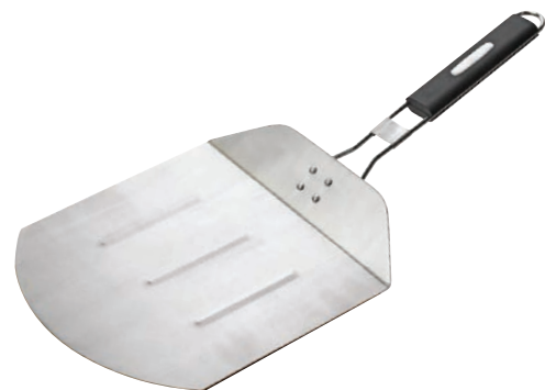
Additional Pizza Peels