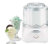
Ice Cream Makers

Discover the complete line of Cuisinart® brand premier kitchen appliances including food processors, mini food processors, hand mixers, blenders, toasters, coffeemakers, cookware, ice cream makers and toaster ovens at