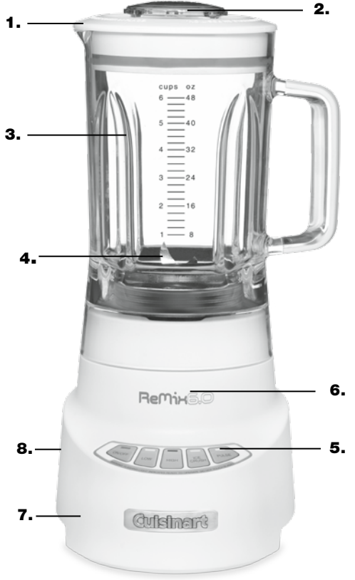
Note: Blades are sharp. Handle carefully.

Keeps countertop safe and neat by conveniently storing excess cord.