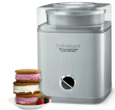
Ice Cream Makers

Cuisinart offers an extensive assortment of top quality products to make life in the kitchen easier than ever. Try some of our other countertop appliances and cookware, and Savor the Good Life®.