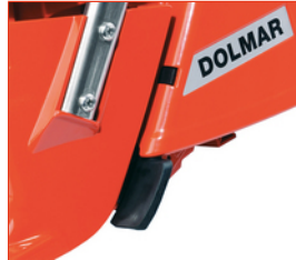
Optimum chip exhaust for avoiding jams