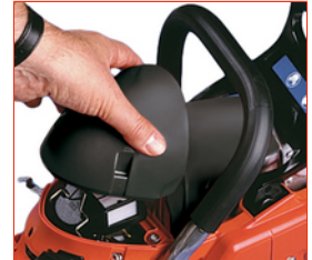
Easy filter maintenance