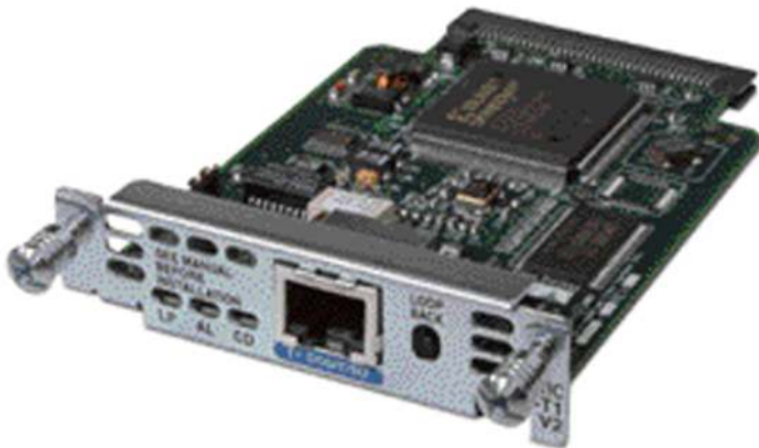
Figure 1. Cisco T1 DSU/CSU WAN Interface Card