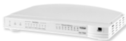
OfficeConnect Hub TP800 3C16722

The OfficeConnect Hub TP800 provides eight unmanaged 100BASE-TX ports for high-bandwidth connectivity to shared Fast Ethernet networks, or for direct 100 Mbps desktop connectivity to power users.