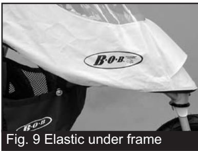
Fig. 9 Elastic under frame