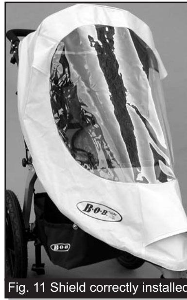
Fig. 11 Shield correctly installed

7. To place your child in the stroller, pull the front of the Weather Shield off the stroller then lift it up and over the forward edge of canopy (see Fig. 10). This will temporarily hold the Weather Shield out of your way while you