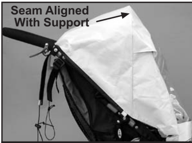
Fig. 6 Shield placed on canopy