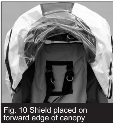
Fig. 10 Shield placed on forward edge of canopy

the black shock knobs as shown in Fig. 7. There is an opening mid way up each side with silver fabric on both ends where the elastic cord is exposed.