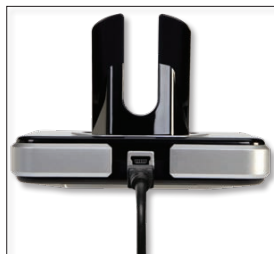
Charger Power Adapter Plug