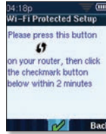
Wi-Fi Protected Setup Instructions