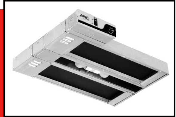
RADIANT*BLACK™ DOUBLE OVERHEADS