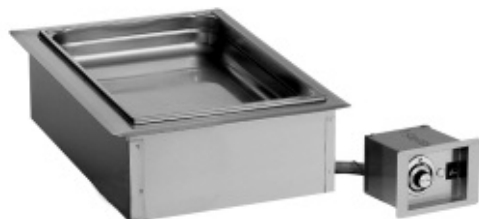
Pan not included