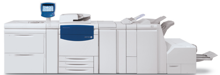
Xerox 700 Digital Color Press

Note: The Xerox SquareFold Trimmer Module requires the Light Production C Finisher with booklet maker and can be used with any of the print servers for the Xerox 700.