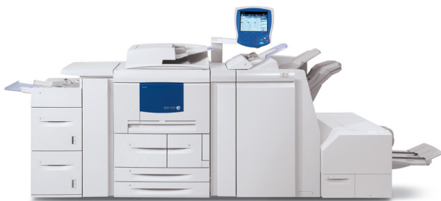
Xerox 4112/4127 Copier/Printer

Note: The Xerox SquareFold Trimmer Module requires the Booklet Maker Finisher and can be used with any of the print servers for the Xerox 4112/4127 Family.