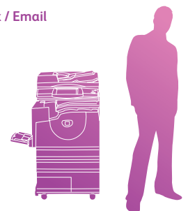
WorkCentre 7300 Series with High Capacity Tandem Tray Option