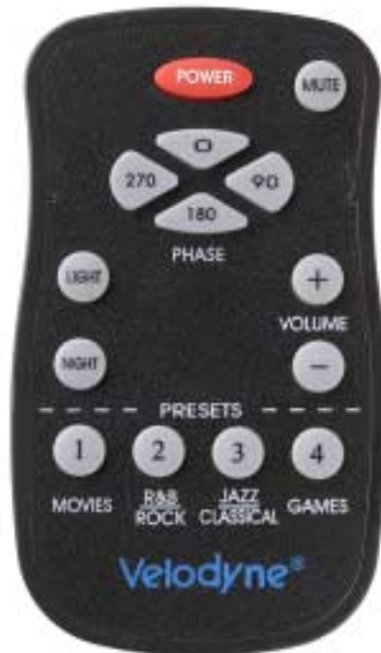
Figure 2. Remote Display

Figure 2 shows the remote control, enabling you to easily choose whatever listening mode you desire.