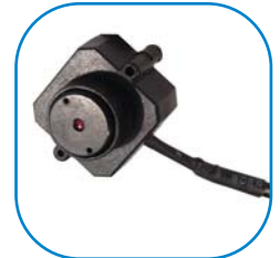
COLOR PINHOLE CAMERA The CMOSCO comes with this complete system.