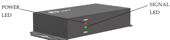
Figure 2: Front Panel