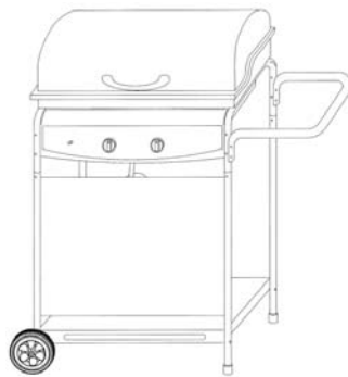
Royal Party 353794

Drawings are not to scale. Specifications subject to change without prior notice.