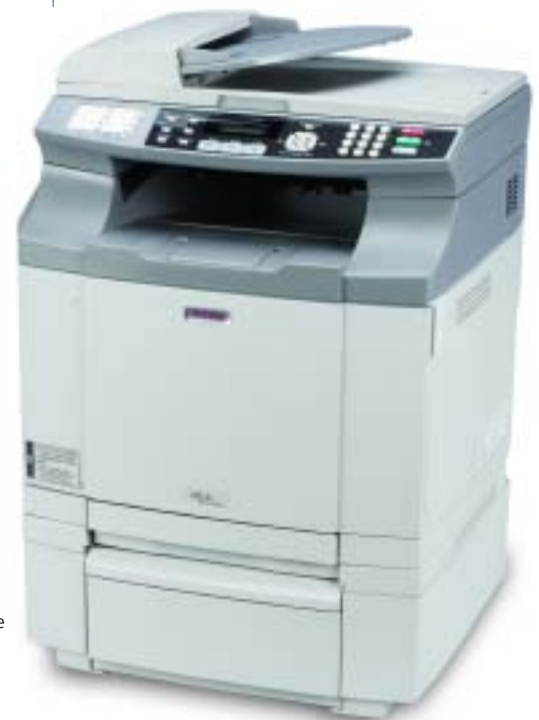
*Shown here with the Optional 530-sheet Paper Tray

Specifications subject to change without notice.