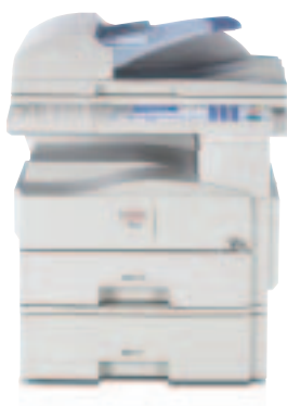
Ricoh Aficio MP 161F