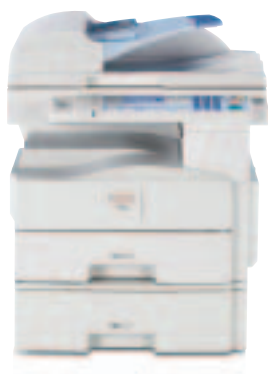
Ricoh Aficio MP 161