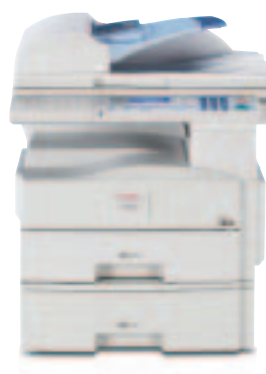
Ricoh Aficio MP 161SPF