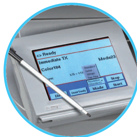
Color touch screen control panel simplifies operation in an easy-to-understand user interface.