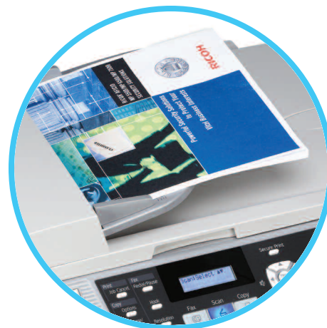
The Ricoh SMFC210M SecureFax can be used to send and receive both color and B&W documents.