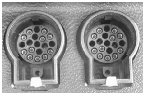
HEAD CONNECTOR TOP VIEW

The light head connectors are key-shaped, snap-in type and will only attach correctly. The plugs must be inserted until the locking snap is heard. Press the flat metal inset to release. The mating pins are automatically lubricated during each insertion and withdrawal to greatly extend the life of these connectors.