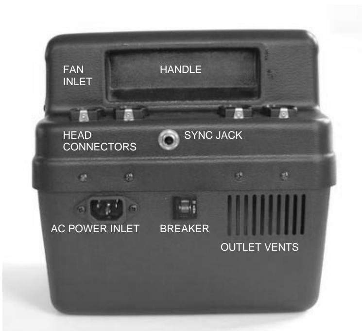
REAR VIEW OF PHOTOMASTER