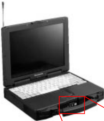
Wireless Modem Panel

The In Coverage LED will flash whenever the modem has logged on to a base station.