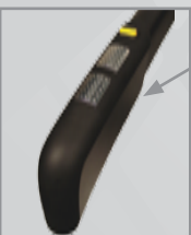
Grip Pulse with Incline Toggle