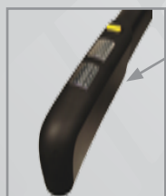
Grip Pulse with Incline Toggle