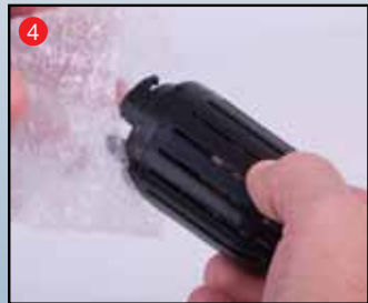
4 Remove the filter from box and remove bag.

*Follow directions to fill and operate the humidifier.