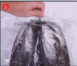
3 Remove the plastic bag from the humidifier.