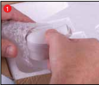
1 Remove the Dual Directional Mist Nozzle from the top of the packaging.